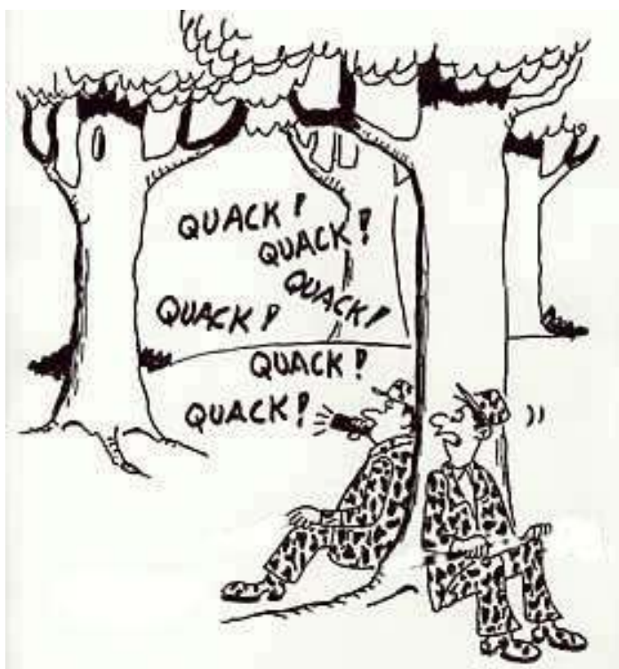
Fred, I told you to bring a buck call, not a duck call.