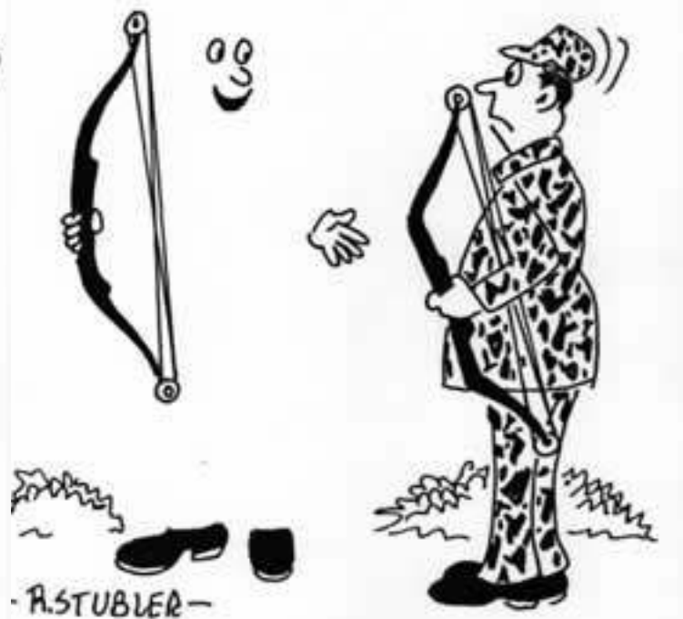
Like my new Camo Outfit?