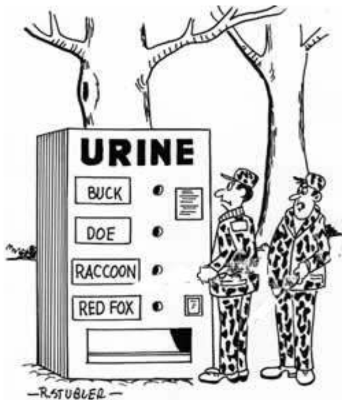
"I know Fish & Wildlife needs more money, but this is getting a bit ridiculous"