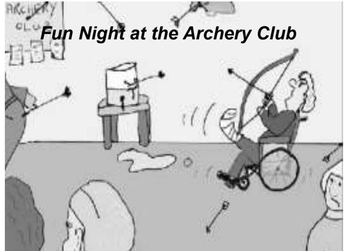
Fun Night at the Archery Club