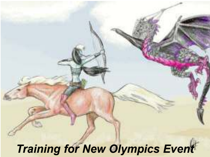
Training for New Olympics Event