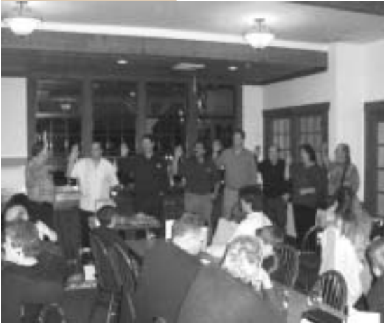
Swearing-In of Officers at Banquet